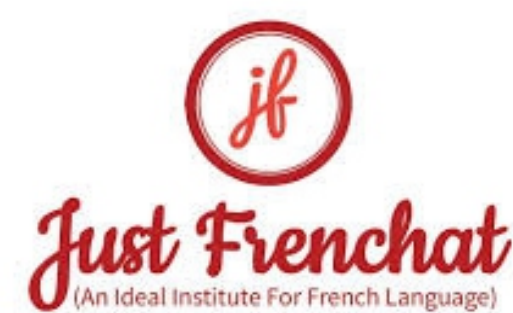
Just Frenchat (An Ideal Institute For French Language)