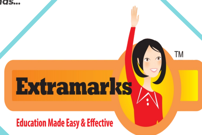
Education Made Easy & Effective